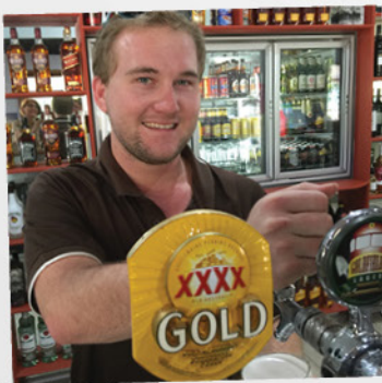
Stop in for a beer at the Award Winning Goldfields Hotel