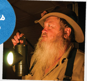
Prepare for a night of mystery on the Forsayth By Night Lantern Tour!