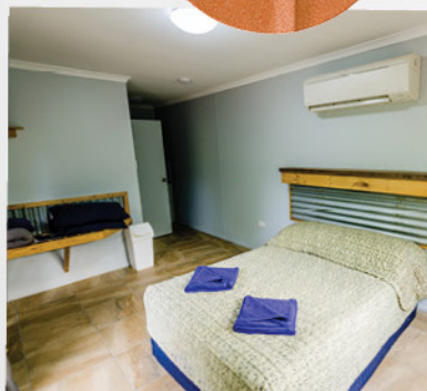
Enjoy comfortable accommodation