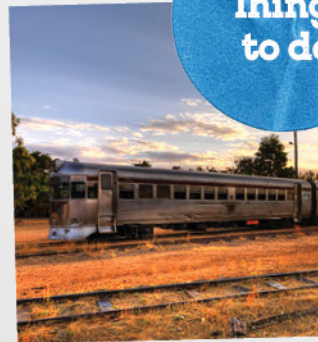
Experience the Savannahlander train