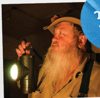
Prepare for a night of mystery on the Forsayth By Night Lantern Tour!