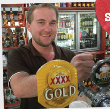
Stop in for a beer at the Award Winning Goldfields Hotel