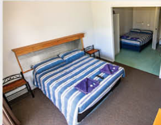
Enjoy comfortable accommodation