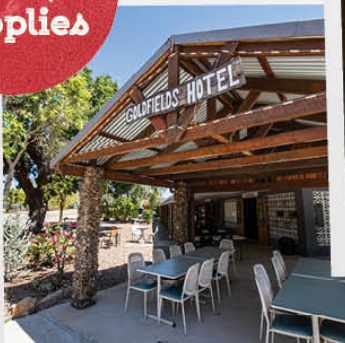
Enjoy the Goldfields Hotel Bistro & Cafe