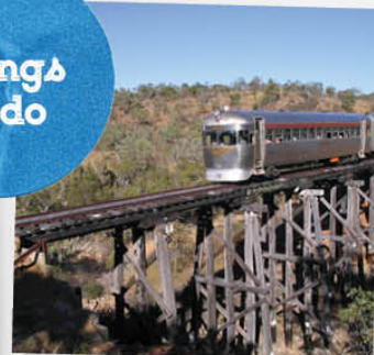
Experience the Savannahlander train